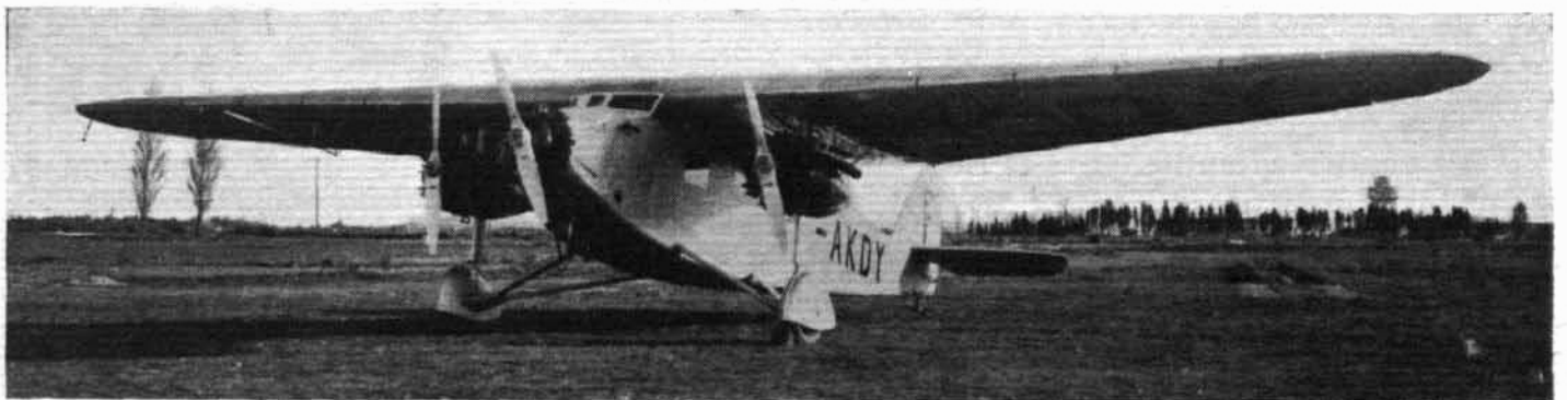
FOR THE MADAGASCAR SERVICE: The S.P.C.A. 41.T monoplane (three 135-h.p. Salmson 9 N.C. engines) to be used on the new French Madagascar-Broken Hill air line.